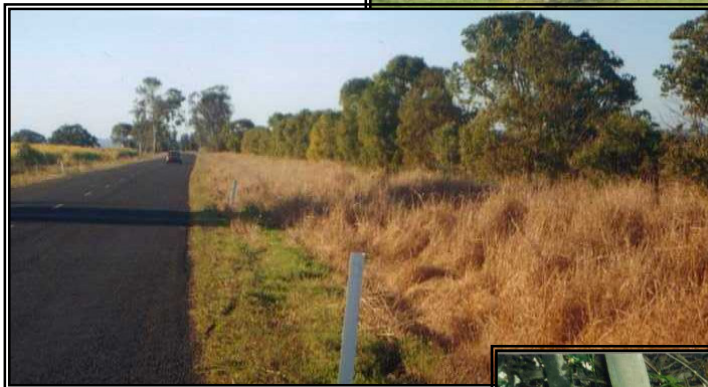
Plate 15: Camphor laurels infesting roadsides in the Clarence valley.