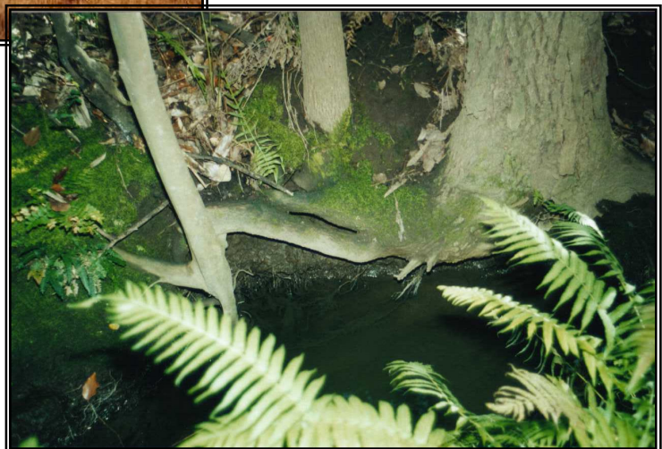
Plate 16: Undercut streambanks infested with camphor laurel.