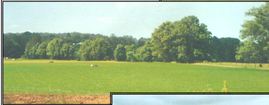
Plate 13: Camphor laurels invading prime agricultural land near Bellinggen.