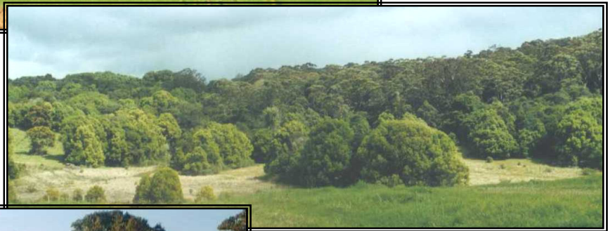
Plate14: Camphor laurels forming part of a wildlife corridor.