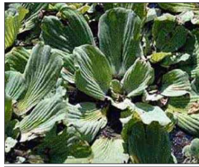
Water lettuce. NSW DPI

Large infestations of water hyacinth and water lettuce were located in the Richmond Shire. Treatment in April: foliar spray of the water hyacinth. The water lettuce infestation was treated within 5 days of discovery, meeting Objective 1 of FNCW management plan. Monitoring will continue downstream of the Infestation to ensure maximum control - treatments to be completed before end of June, follow up works in spring.