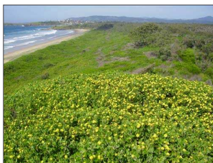
Bitou bush, MBNR.